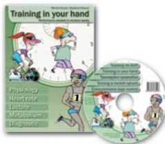
Training in your hand - Performance analysis in amateur sports (also on CD with 5 languages)

Additional diagnostic tools can be found in our latest product catalogue and in the Internet: