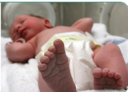
Lactate in Maternity Hospitals Birth Medicine

Diabetic people are very often overweight. Here it is not the target to improve the endurance or the power, but it is essentially to learn “healthy move” again. These patients will be trained at the aerobic level (below 3 mmol/l) only, to avoid critical effects of oversized effort (see 1.4). Featured similar to typical Glucose meters, the Lactate SCOUT fits perfectly the demands herein. Many doctors are supporting their patients with the Lactate SCOUT; the University Cologne and other institutes use the Lactate SCOUT as the reference device in training projects for overweight people, including adolescents and children. Applications in pediatrics are reported as well.