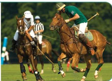
Lactate in Animal Sports

which is established by many horse coaches. The Lactate SCOUT also compensates the hematocrit-influence as an important parameter in the veterinary field. As confirmed in several studies (University Cordoba and Minnesota), the higher viscosity of the blood of animals is not critical herein. The very low sample volume of 0,5 µl recommends the Lactate SCOUT also for small animals, as mice and pets, or canine and falcon sports.