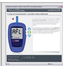
VisiGuide Lactate SCOUT